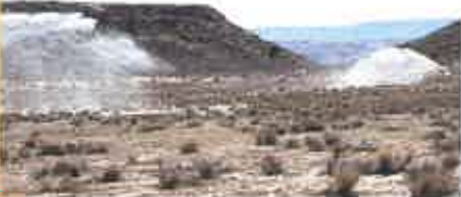
Toquerville farm with pressurized irrigation system.

An agreement was signed that allowed the district to purchase water shares from the Toquerville Irrigation Company for nearly $1 million and create the Toquerville Secondary Water System (TSWS). The new system replaced an open ditch canal with a pressurized irrigation system to provide water to the city and outlying fields while increasing conservation opportunities, improving system management and mitigating the safety issues presented by an open canal. TSWS currently has approximately 300 connections and is managed by a five-member board appointed by the city and district.