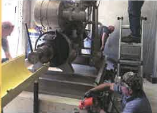
Toquerville new engine installation

Approximately $400,000 was spent by the district to increase and improve the TSWS pumps, purchased a turbo-charged engine and repaired a leaking pond by installing a custom 20,000-pound synthetic liner.