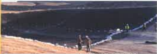
Toquerville pond liner install