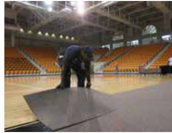
This high-performance, portable floor cover system incorporates easy alignment, quick assembly and reduced storage requirements.