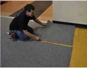
Tiles are easily cut to fit your facility.

Connor Sports • 800.283.9522 • 847.290.9020 • info@connorsports.com • connorsports.com