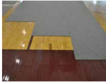
Unique features include recycled non-marking thermoplastic backing, highly stain resistant surface and excellent sound absorption.