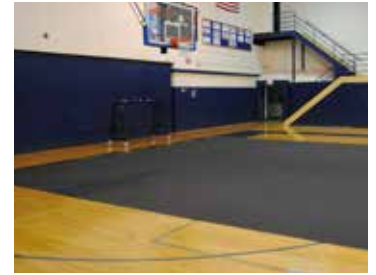
Transform your gymnasium into a high-end meeting space without worrying about damaging your hardwood court investment.