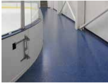
Smooth, non-porous finish provides easy maintenance. No waxing, stripping or refinishing required.