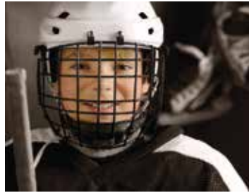
Resists bacterial contamination. Ideal for keeping locker rooms clean, healthy and virtually odor free.