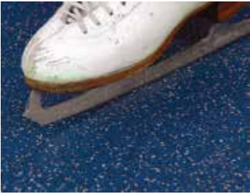
Ideal for ice rink perimeters, locker rooms and other areas subjected to traffic from hockey blades and ice skates.

Connor Sports • 800.283.9522 • info@connorsports.com • connorsports.com/traction