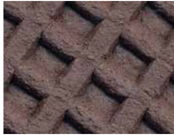
Unique symmetric bottom layer design provides outstanding shock absorption and uniform performance.