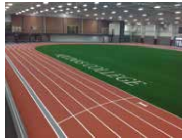
I.A.A.F. certified and suitable for all NCAA and International events.