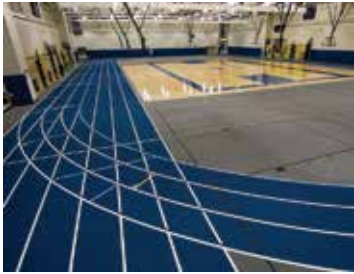
Prefabricated rubber sport surface made from synthetic & natural rubber compounds.

Connor Sports • 800.283.9522 • info@connorsports.com • connorsports.com/traction