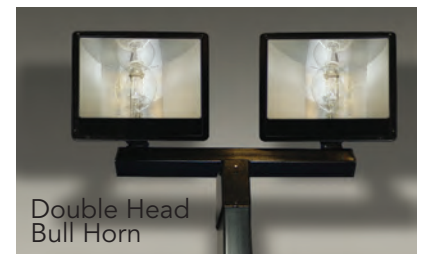
Double Head Bull Horn

To find a Sport Court® dealer in your area visit us at www.sportcourt.com or call 800-421-8112